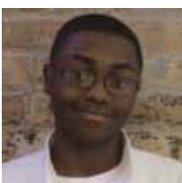
Charles Wilson Fenwick High School