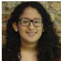
Angelica Contreras De La Salle Institute